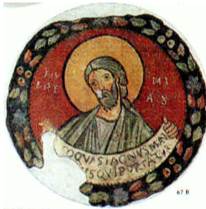
Roman School Fresco of Jeremiah, c. 1120

With weeping they shall come, and with consolations I will lead them back, I will let them walk by brooks of water, in a straight path in which they shall not stumble; for I have become a father to Israel, and Ephraim is my firstborn.