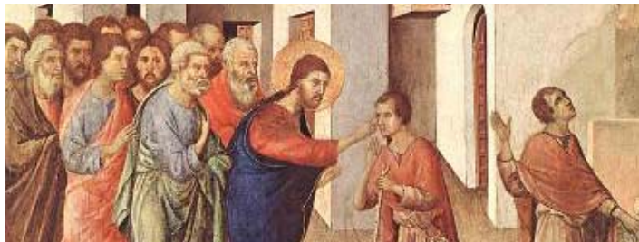
Duccio di Buoninsegna. Healing of the Blind Man.

Jesus and his disciples came to Jericho. As he and his disciples and a large crowd were leaving Jericho, Bartimaeus son of Timaeus, a blind beggar, was sitting by the roadside. When he heard that it was Jesus of Nazareth, he began to shout out and say, "Jesus, Son of David, have mercy on me!" Many sternly ordered him to be quiet, but he cried out even more loudly, "Son of David, have mercy on me!" Jesus stood still and said, "Call him here." And they called the blind man, saying to him, "Take heart; get up, he is calling you." So throwing off his cloak, he sprang up and came to Jesus. Then Jesus said to him, "What do you want me to do for you?" The blind man said to him, "My teacher, let me see again." Jesus said to him, "Go; your faith has made you well." Immediately he regained his sight and followed him on the way.