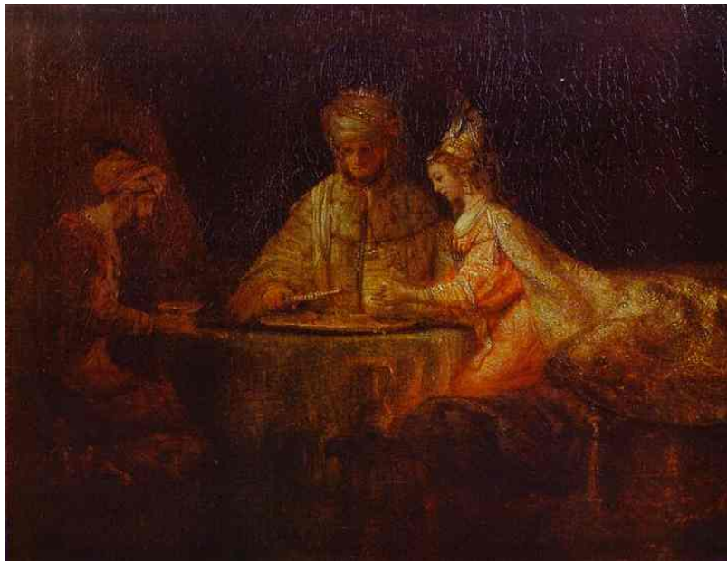
Rembrandt. Assuerus, Haman and Esther . 1660.

The king and Haman went in to feast with Queen Esther. On the second day, as they were drinking wine, the king again said to Esther, "What is your petition, Queen Esther? It shall be granted you. And what is your request? Even to the half of my kingdom, it shall be fulfilled." Then Queen Esther answered, "If I have won your favor, O king, and if it pleases the king, let my life be given me-- that is my petition-- and the lives of my people-- that is my request. For we have been sold, I and my people, to be destroyed, to be killed, and to be annihilated. If we had been sold merely as slaves, men and women, I would have held my peace; but no enemy can compensate for this damage to the king." Then King Ahasuerus said to Queen Esther, "Who is he, and where is he, who has presumed to do this?" Esther said, "A foe and enemy, this wicked Haman!" Then Haman was terrified before the king and the queen.